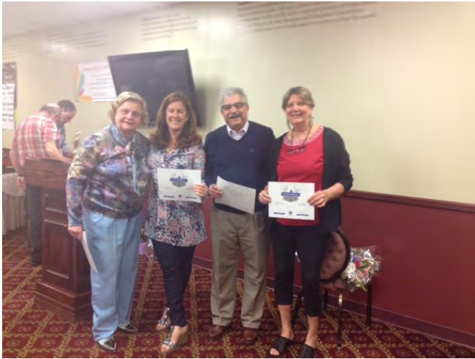
2016 Ace of Clubs Winners