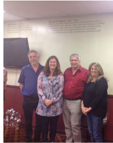
2016 Mini-McKenney Winners