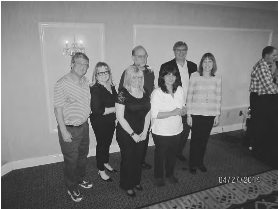
2013 Mini-McKenney Winners