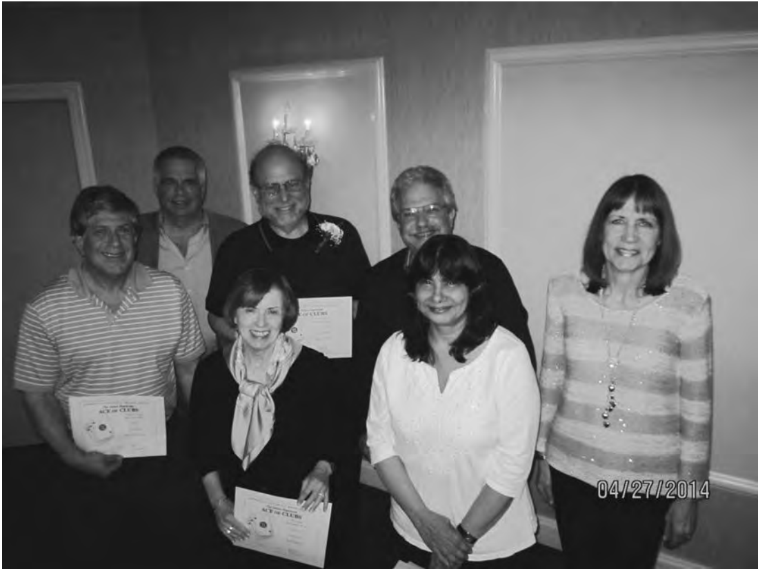
2013 Ace of Clubs Winners