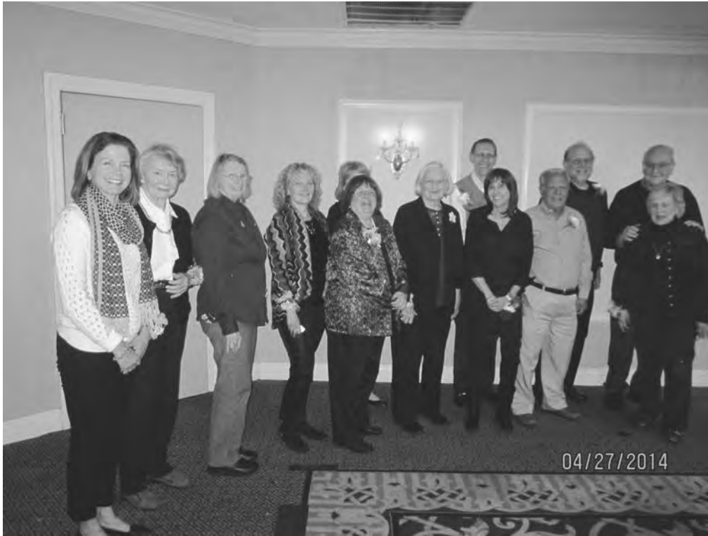
Congratulations to the NSBA's New Life Masters